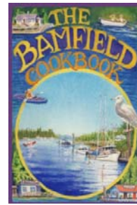
mmm Cook book