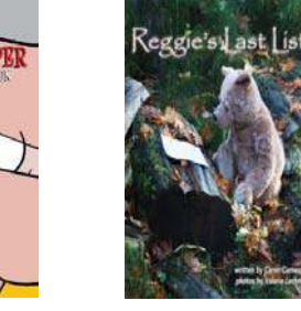
Child ren's books